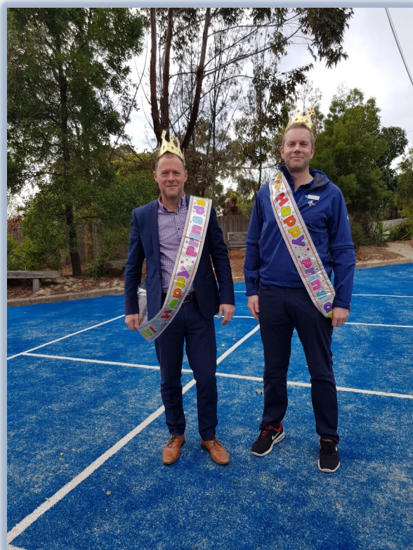
Kings of the (Synthetic) hill. Happy Principals' Day!