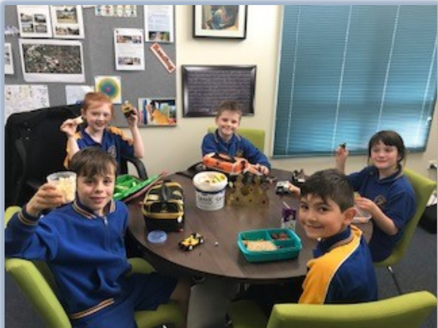
Principal's Lego Lunch